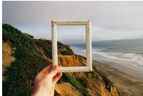
Seeing the bigger picture